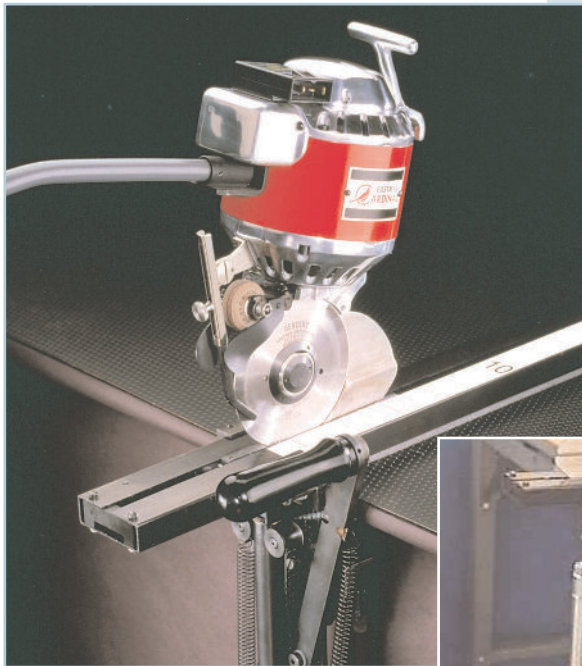
Eastman Heavy Duty Falcon 548 End Cutter with Easy Glide Track and Quick Lift.

The new optional Air Lift feature allows the operator to lift the track with the flip of a switch, reducing operator fatigue and cycle time.