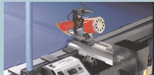
Auto Track Falcon II / Model ATFII