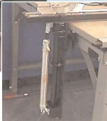
Eastman Air Lift Feature