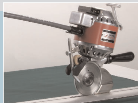
Heavy Duty Falcon 548 Model 548 FALHD

- The standard of the industry for upholstery cutting. Also recommended for covers and tops.