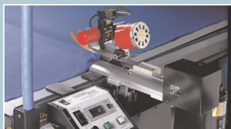
Auto Track Falcon II Model ATFII